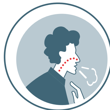
FIATO CORTO SHORTNESS OF BREATH