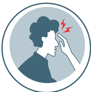
MAL DI TESTA HEADACHE